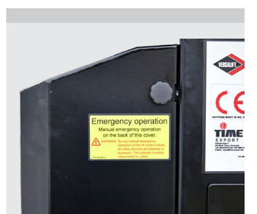
Ground level emergency lowering from the chassis (pedestal mounted valve bank)