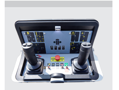
LMC (Load Moment Controls): Variable outreach and up to 2 actions at a time (1 per joystick)