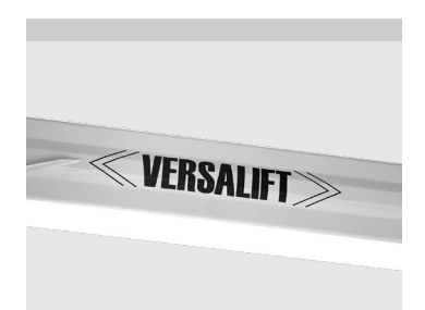
The shaped profile ultra high strength steel booms provide improved rigidity, stiffness and performance

Outrigger pads with holders Hydraulic axle locking system Flashing lights on the roof Aluminium cabinets for the chassis Safety stripes (red/white) Reversing camera Display in the upper control panel Stow guide & limited working area without outriggers