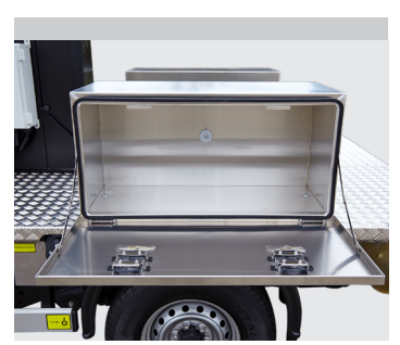
Aluminium cabinets for the chassis (optional)