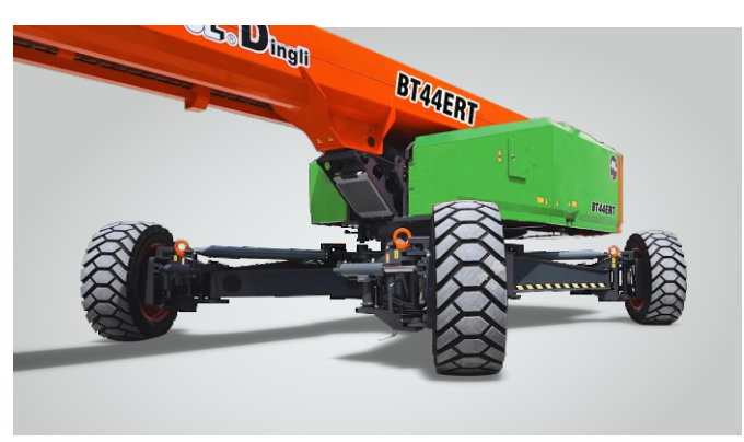
Brand New One-Key In-Situ Axle Expansion Technology Global Patent Protection